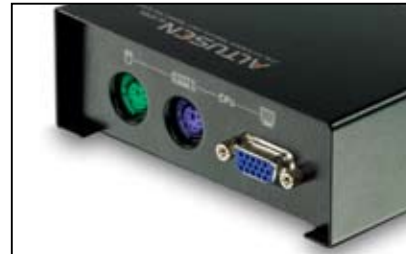
■ PS/2 Console