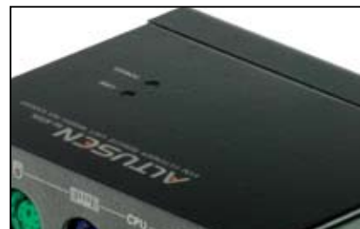
■ LED Status Display