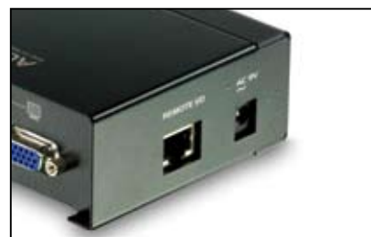
■ RJ-45 Connector for Cat 5 (or higher) cable Connection to the KH0116