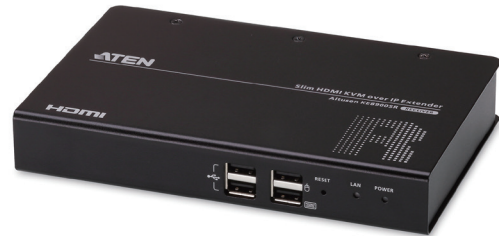
KE8900SR Front View