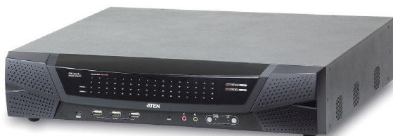
KN8164V Front view